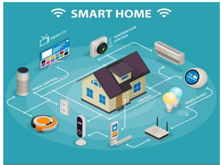
Figure 1. variety of IoT devices in smart homes.

Selecting energy-efficient hardware components is a vital aspect of low-power design for IoT devices. Recent advancements in semiconductor technology have led to the development of ultra-low-power microcontrollers, sensors, and communication modules tailored for loT use. These components are engineered to consume minimal power during both active and idle states, employing techniques like dynamic voltage and frequency scaling (DVFS), power gating, and energy-efficient signal processing [2]. For instance, modern microcontrollers offer multiple power-saving modes that can be adjusted based on the device's operational requirements, resulting in significantly reduced power consumption. Optimizing communication protocols is also key to